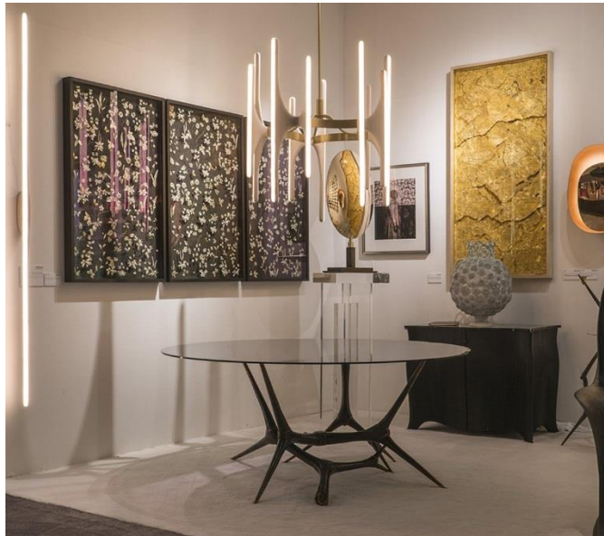
Todd Merrill Studio