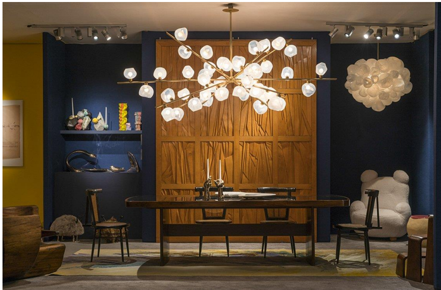
R + Company

THE SALON ART + DESIGN , an epic and extraordinary event produced by Sanford Smith + Associates, will return for its seventh edition to the iconic Park Avenue Armory in New York City, opening on November 9th and running through November 12th. With record attendance numbers in 2017, THE SALON has emerged as a preeminent art and design fair, lauded for unparalleled eclecticism, vibrant energy, and the unabashed luxuriousness of its offerings. Reflecting a global approach to design and collecting, the fair will host 57 galleries from 11 different countries, and with more than half of the exhibitors coming from outside the United States, it is an opportunity to view a selection and range of work rarely seen here. The show mirrors the current expanded thinking on art and design, with their definitions and boundaries broadened to include a wide range of creative works as art, and design objects now recognized as works of art themselves.