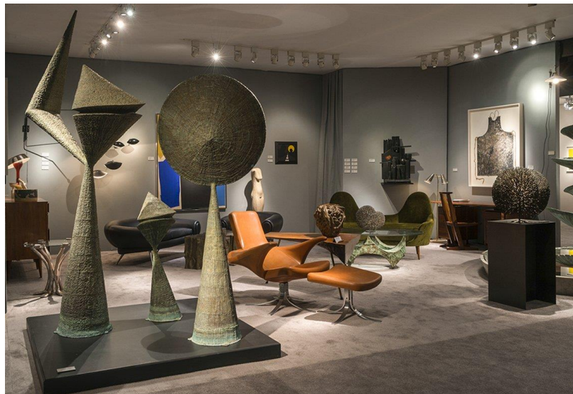
Lost City Arts