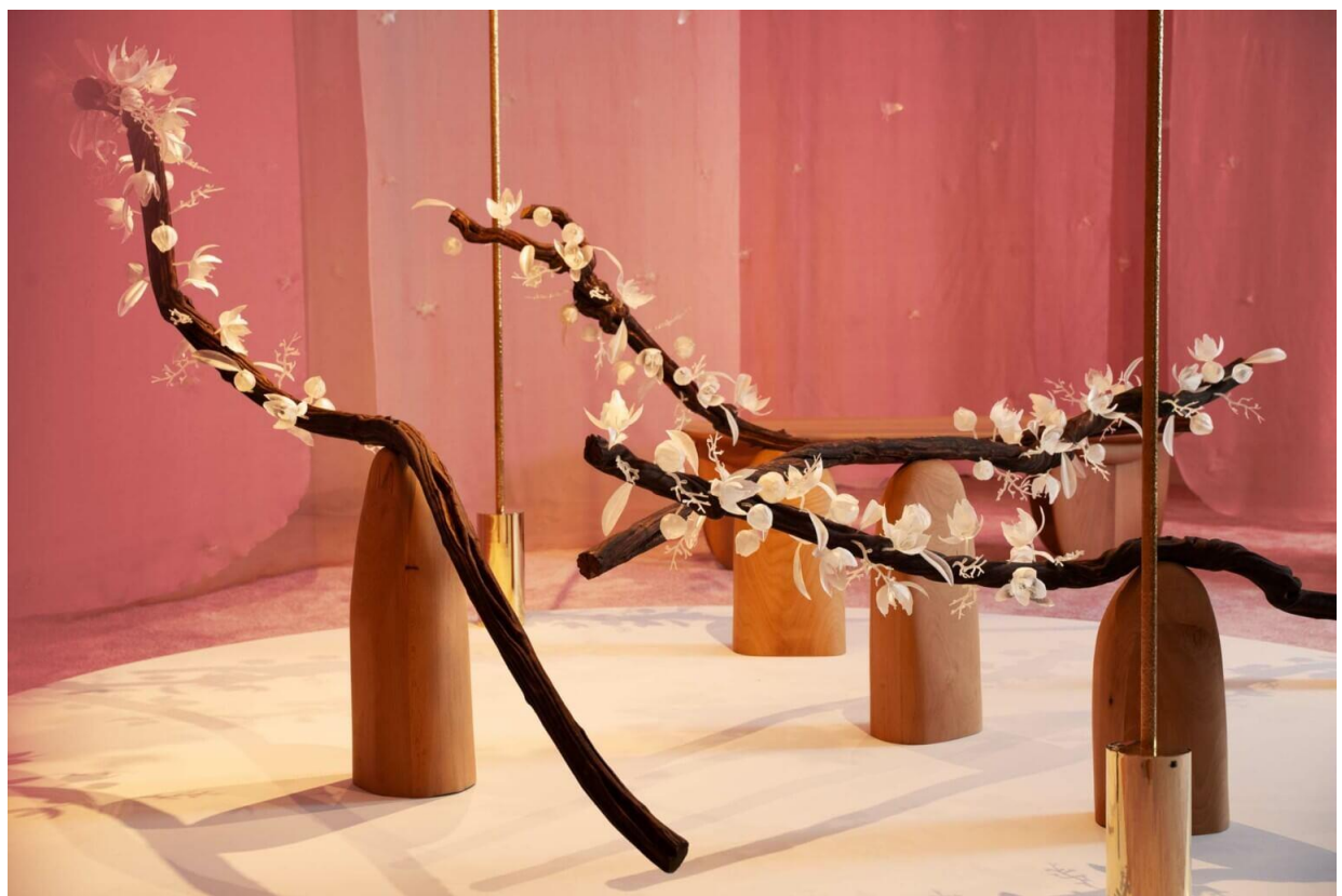
Fernando Laposse's The Pollination Dance for Maison Perrier-Jouët (Courtesy Maison Perrier-Jouët)