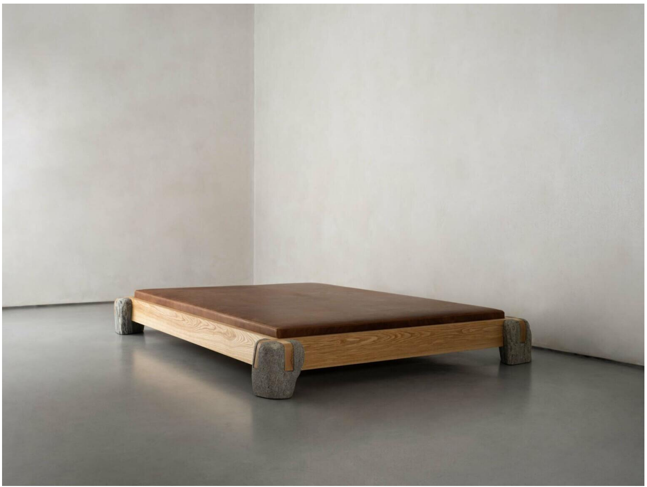
Ethan Stebbins's Wabi Sabi Bed at Ateliers Courbet