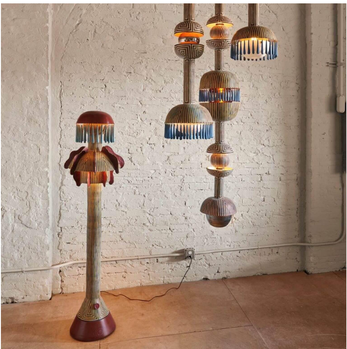
Jeremy Anderson's Sky Floor Lamp at Gallery Fumi