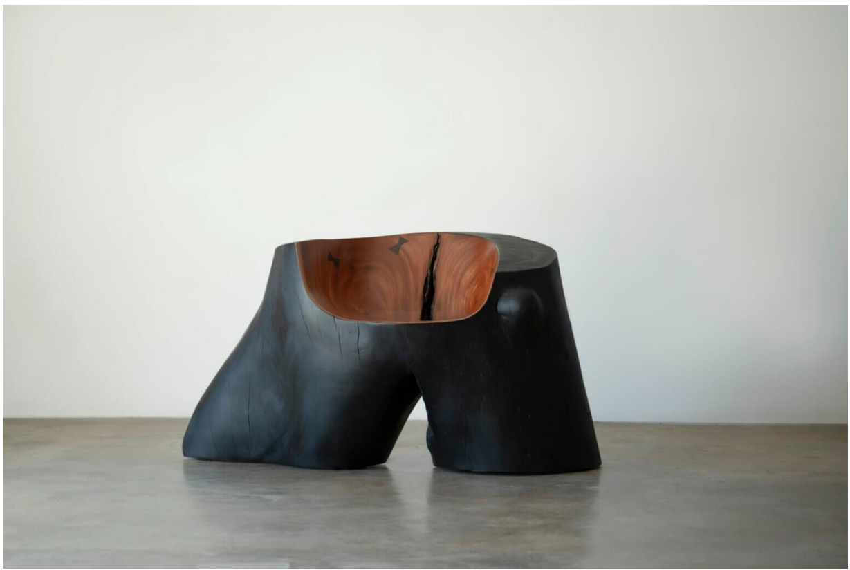
Reynold Rodriguez's En Tus Brazos