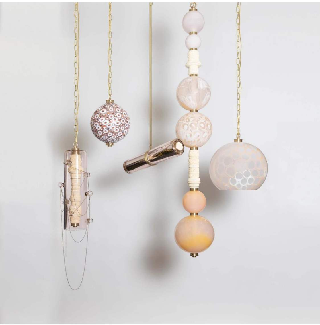
Feyza Koksal Kemahlioglu's Glowing Sentiments 1 at Wexler Gallery