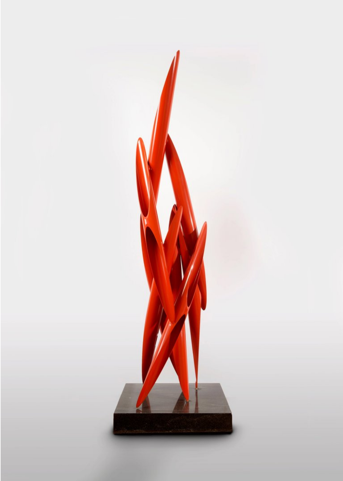
"Aim" by Alexander Liberman. Showcased at Art Miami 2018