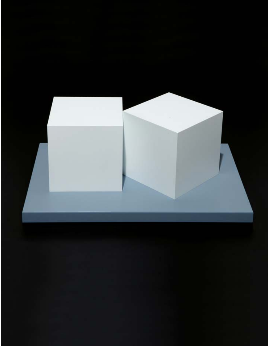
"Two Cubes" by Sol LeWitt. Showcased at Art Miami 2018