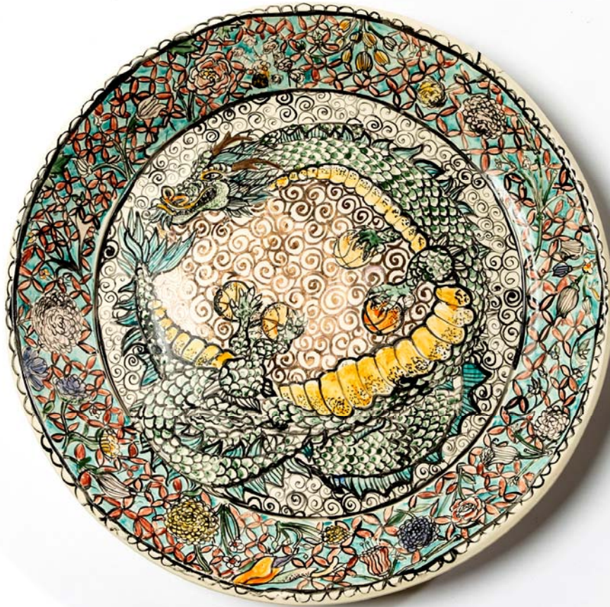
"Double Dribble Dragon" (2018) by Roberto Lugo. White earthenware and china paint. Showcased at Art Miami 2018

The gallery focus itself in erasing the borders that separate art from design and that establish traditional art norms, trying to reach an unbeatable level of excellency in contemporary fine art .