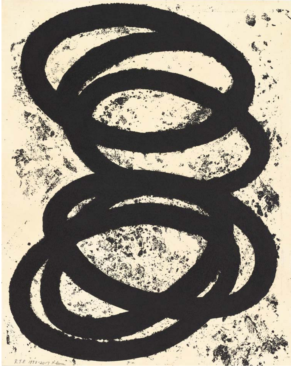
"Finally Finished" by Richard Serra. Showcased at Art Miami 2018

There is nothing more powerful and fascinating than the variety in art. We can't wait to experience its power in Art Miami 2018 .