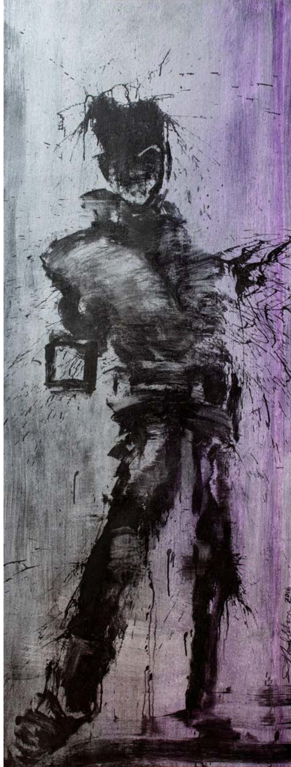
“Standing Shadow” by Richard Hambleton. Showcased at Art Miami 2018