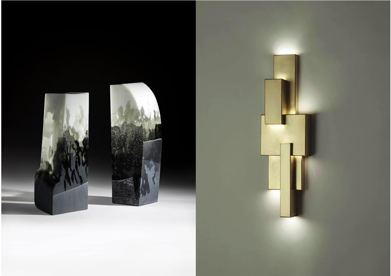
Exhibits by Galerie Negropontes

Galerie Negropontes from Paris, through its curated display fosters a dialogue between classicism and modernity. Though the gallery initially focused on highlighting French decorative artworks, they now represent and display artworks and sculptural furniture pieces from diverse creative backgrounds. Galerie Negropontes, has through its course managed to seamlessly erase the fictitious distinction between artisans and artists, and merge creative art with contemporary design. For the design fair, the French gallery will be hosting works of Éric de Dormael, Erwan Boulloud, Jean-Christophe Malaval Rometti, Perrin & Perrin and Gianluca Pacchioni.