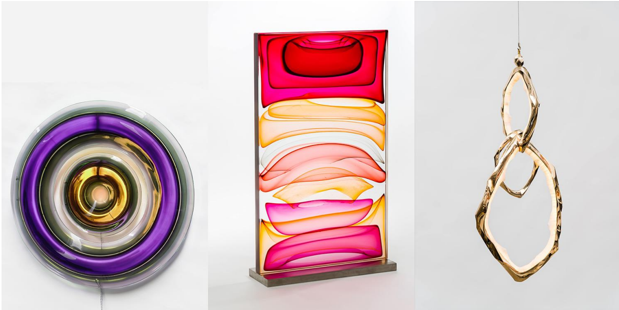
Exhibits from Todd Merrill's display at the Salon Art + Design 2022

Presenting a dynamic display of modern design , contemporary fine art and design gallery Todd Merrill Studio will be participating for the sixth time. Their exhibition is centered on the juxtaposition of contrasting materials and textural surfaces and comprises lighting and furniture design pieces fabricated using sleek lacquered finishes, cast bronze, moulded paper, natural wood and luminous transparent resin. Designers from across the world including designer duo— Draga & Aurel, Jamie Harris and gallery artists—Markus Haase and Alex Roskin will exhibit their studio experimentations and meticulous craftsmanship to create an illustrious visual for the gallery.