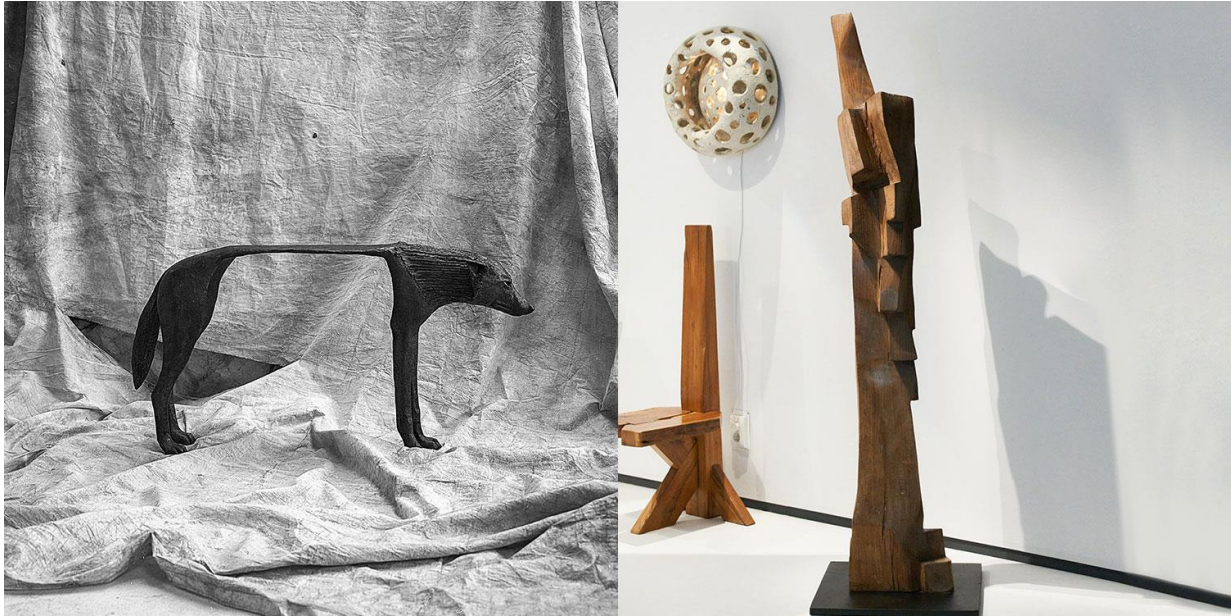
Loup (Wolf) bench (left) and Personnage Cubiste (right)