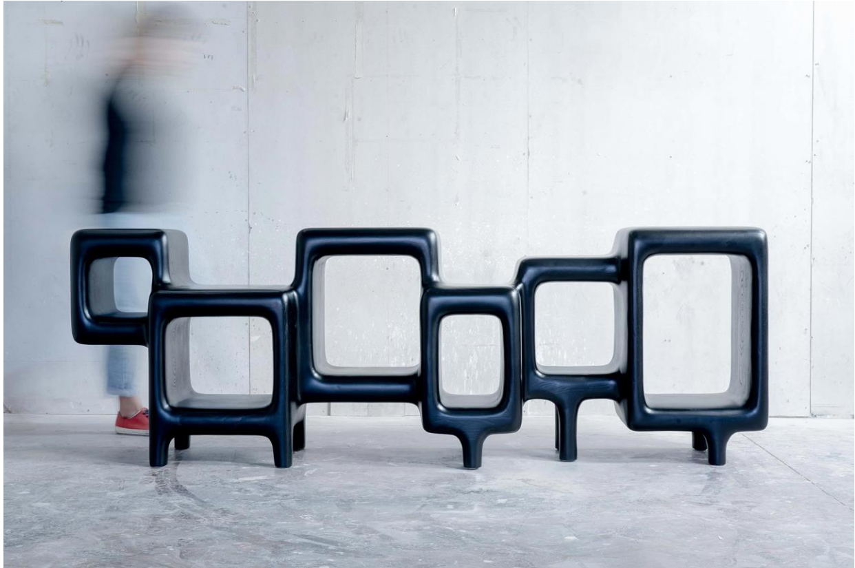
The Monopole Sideboard