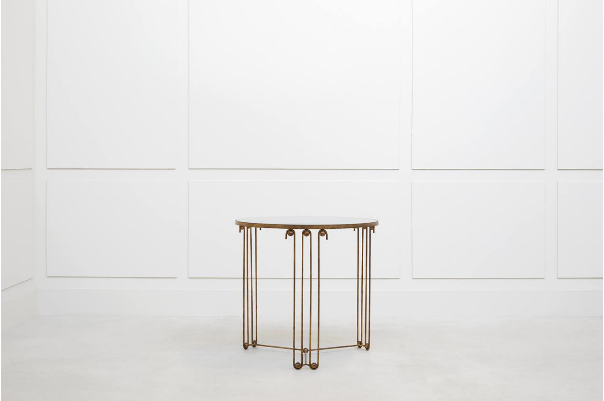
Jean Royere's Ondulation displayed by Galerie Chastel-Merchal