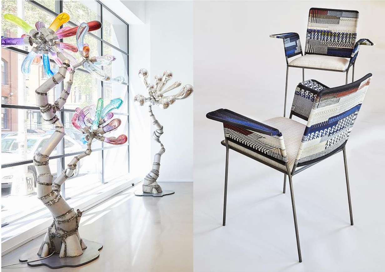
The Polumbo Trees and the Dagdelen Chairs