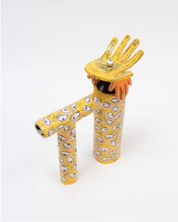
Bruce M. Sherman, Woman With Fish , 2016.