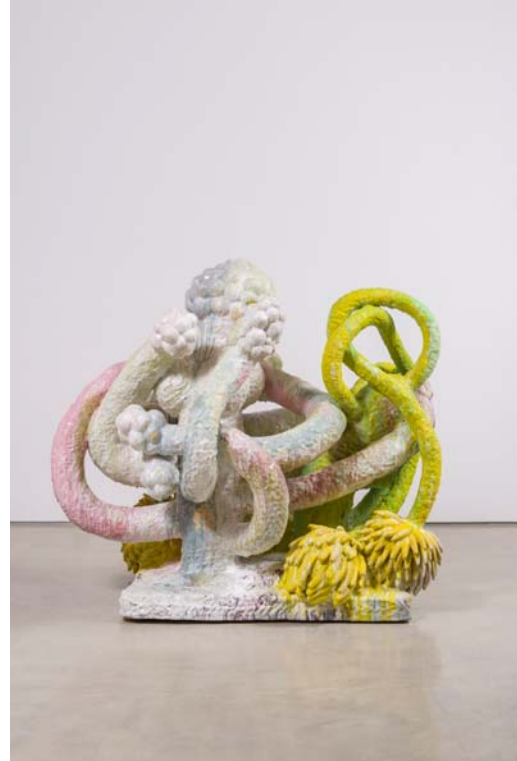
Matt Wedel, Banana Tree , 2015.