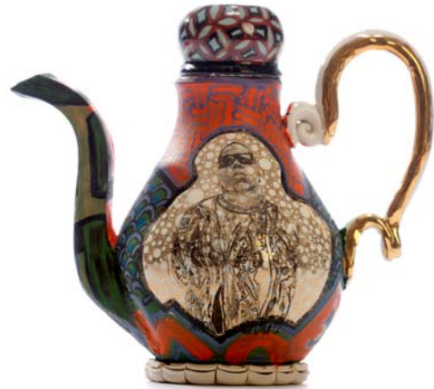
Roberto Lugo, Biggie / Celia Cruz , 2016.