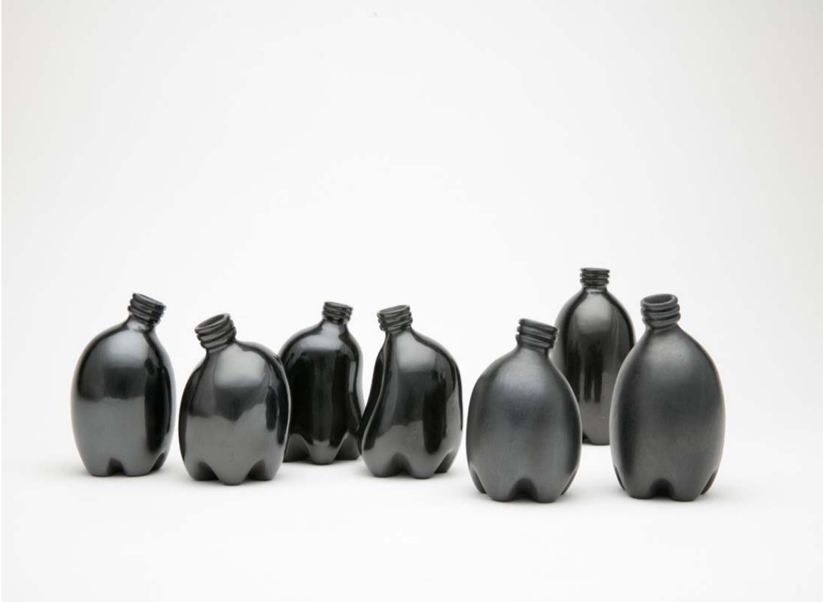
Jami Porter Lara, Go On Now (detail), 2016.