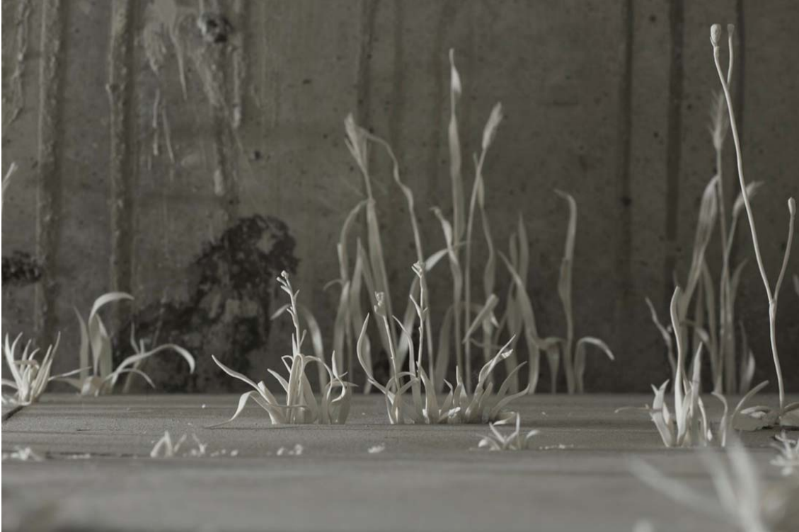
Katie Spragg, Wildness (detail), 2016.