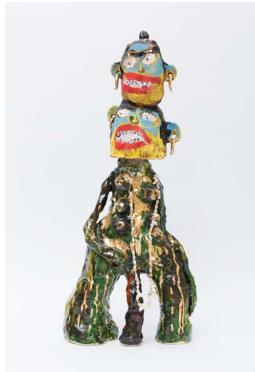
Ramesh Mario Nithiyendran, Untitled Figure 10 , 2016.