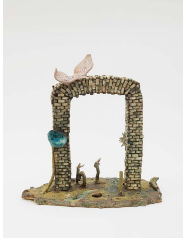
Aaron Angell, Pink Bird , 2015.