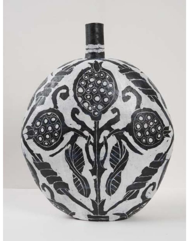
Elisabeth Kley, Pineapple , 2016.