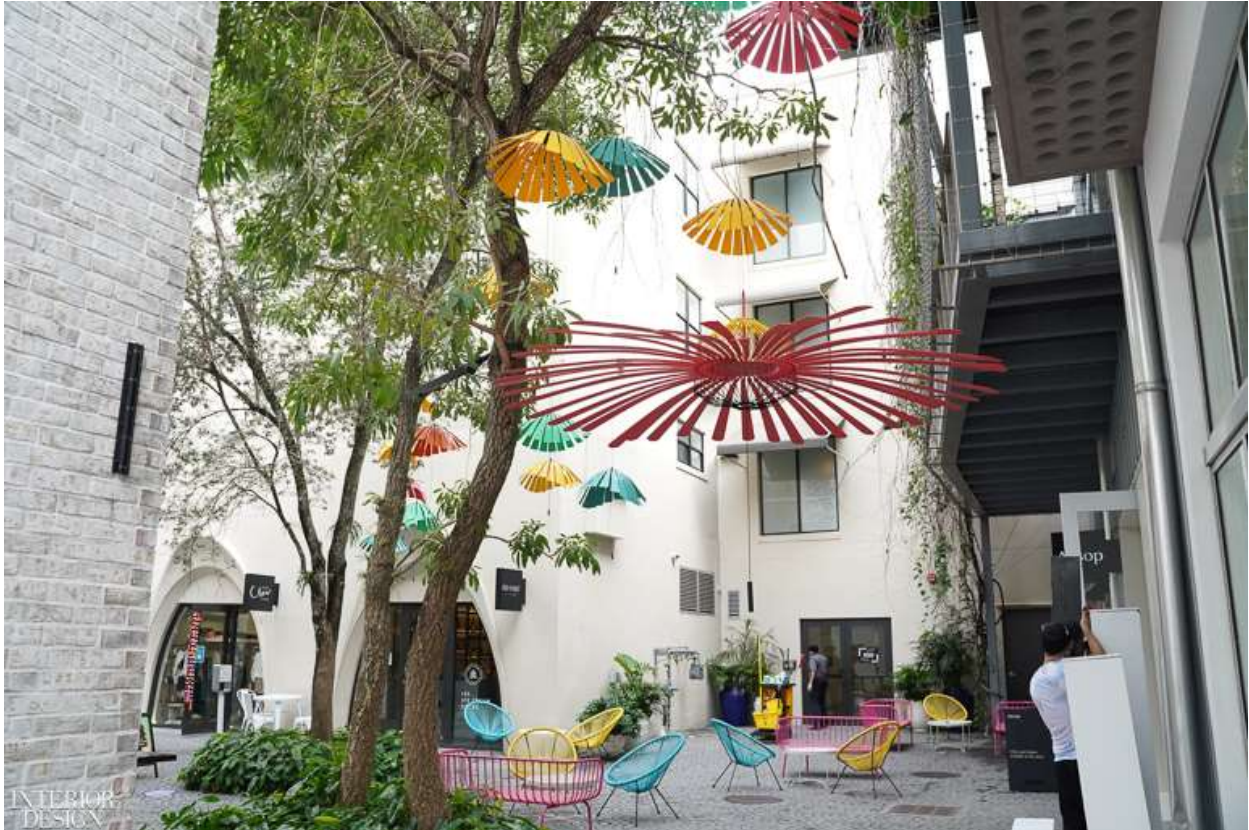
Conscious Actions was a series of interactive installations throughout Design District.