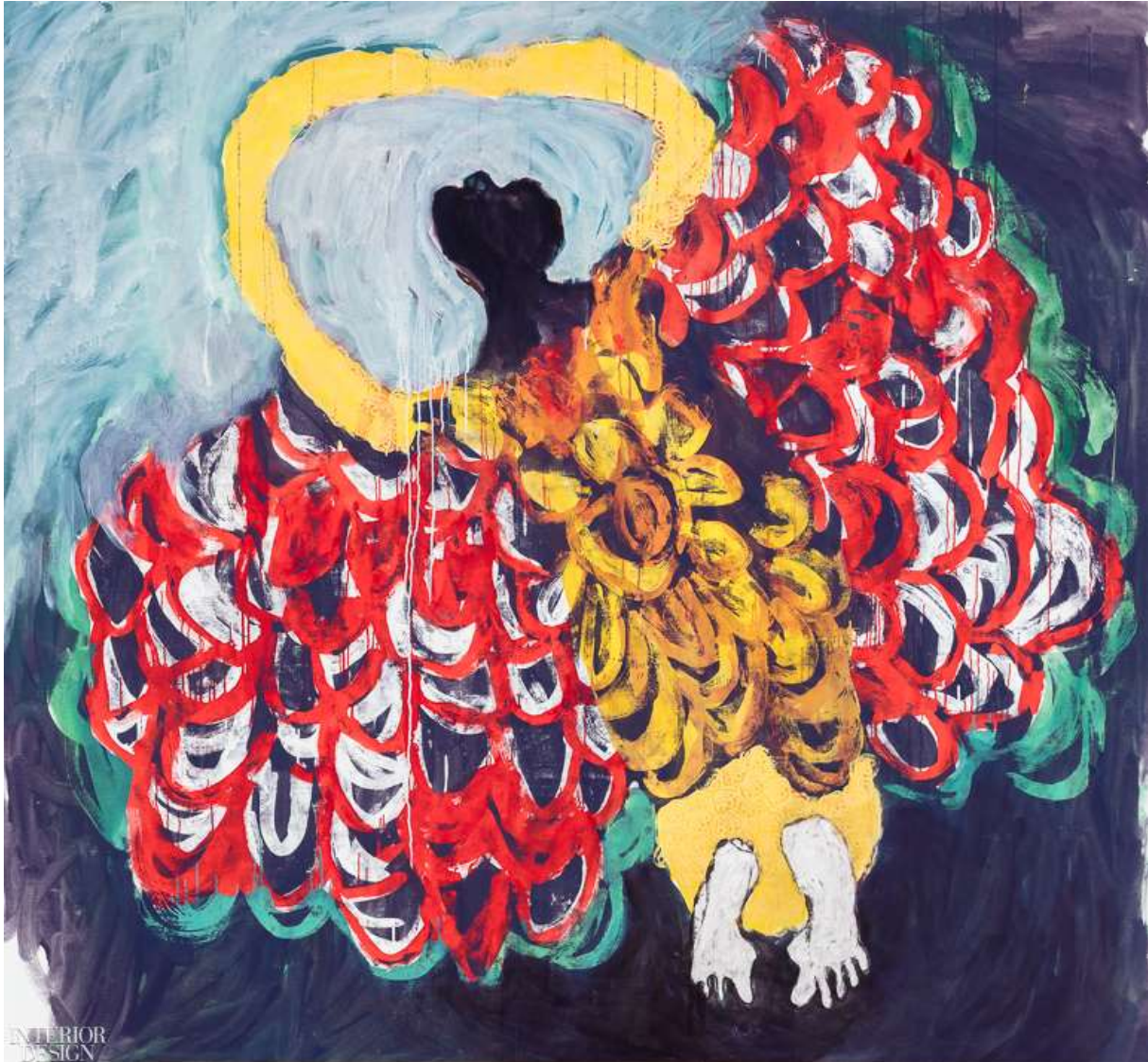
Gliding on My Knees to Heaven by Portia Zavaheira.

Some of the best artistic talent from Africa, Latin America, and the Caribbean is on display at PAMM in an exhibition called “Allied with Power: African and African Diaspora Art.” The show includes more than 40 works from billionaire and art patron Jorge Pérez’s personal collection that will become part of the museum’s permanent collection. Among the highlights are a spectacular construction of electrical wire called Tightrope by Elias Sime, an untitled piece made of nails, thread, and metallic paint on wood by Sonia Gomes, and a work rendered in oil-based printing ink called Gliding on My Knees to Heaven by Portia Zavaheira. 1103 Biscayne Blvd, Miami, FL 33132