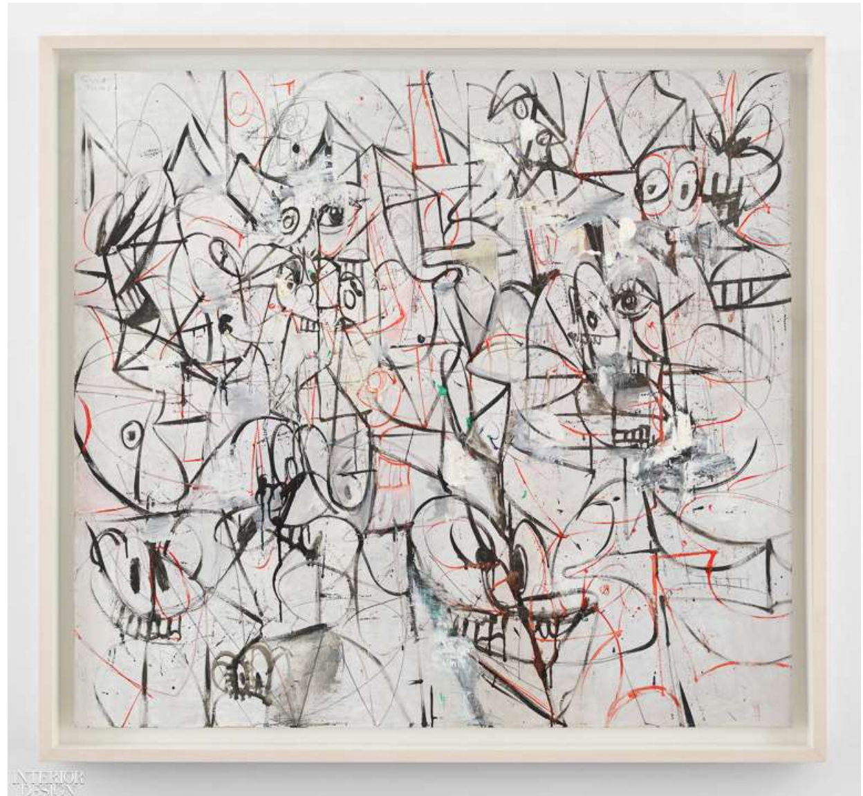
INTERIOR DESIGN Red & Black Thought by George Condo.

Works on display at the Jason Jacques Gallery in the Design Miami/Podium exhibition include both manmade and natural wonders. "Wishbone," a monumental freestanding sculpture carved from a single piece of ancient redwood heartwood in the 1980s by American sculptor J.B. Blunk, was crafted with minimal transformation to the material in order to keep the memory of the living tree intact. The monolithic sculpture contrasts with two nearly complete Camptosaurus and Allosaurus dinosaur skeletons excavated in Wyoming and presented by the same gallery. Moore Building 191 NE 40th St, Miami, FL 33137