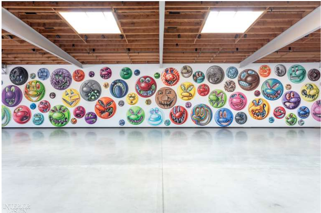
"Kenny Sharf: Moodz."