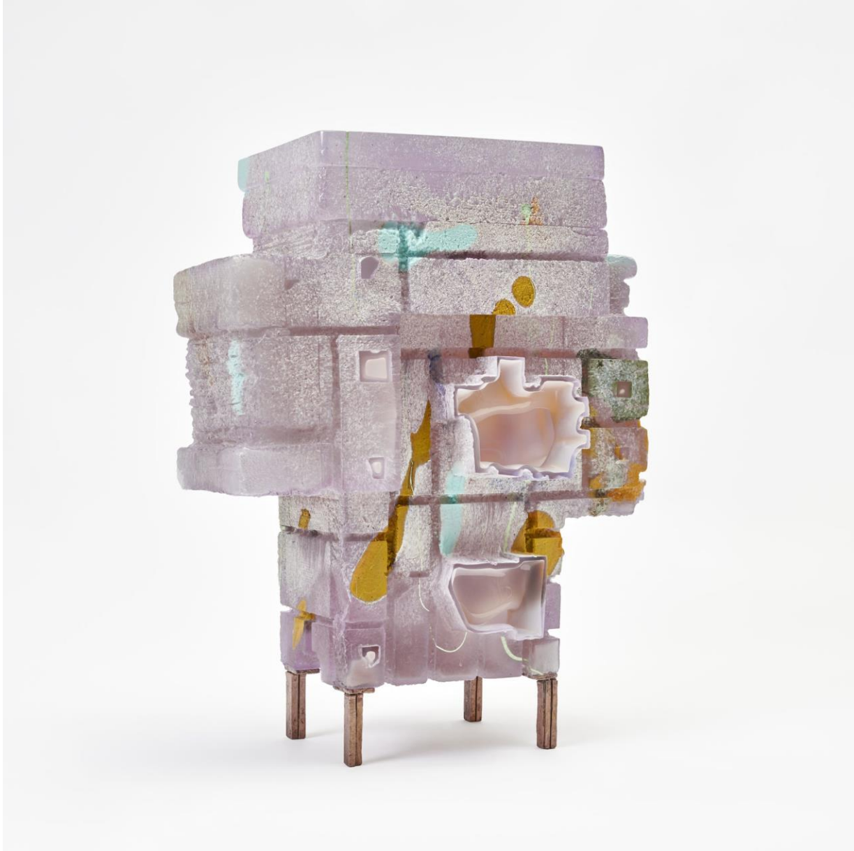
Represented by Friedman Benda: Untitled by Thaddeus Wolfe, 2022, crafted in glass and bronze. Acquired by the Chrysler Museum of Art.