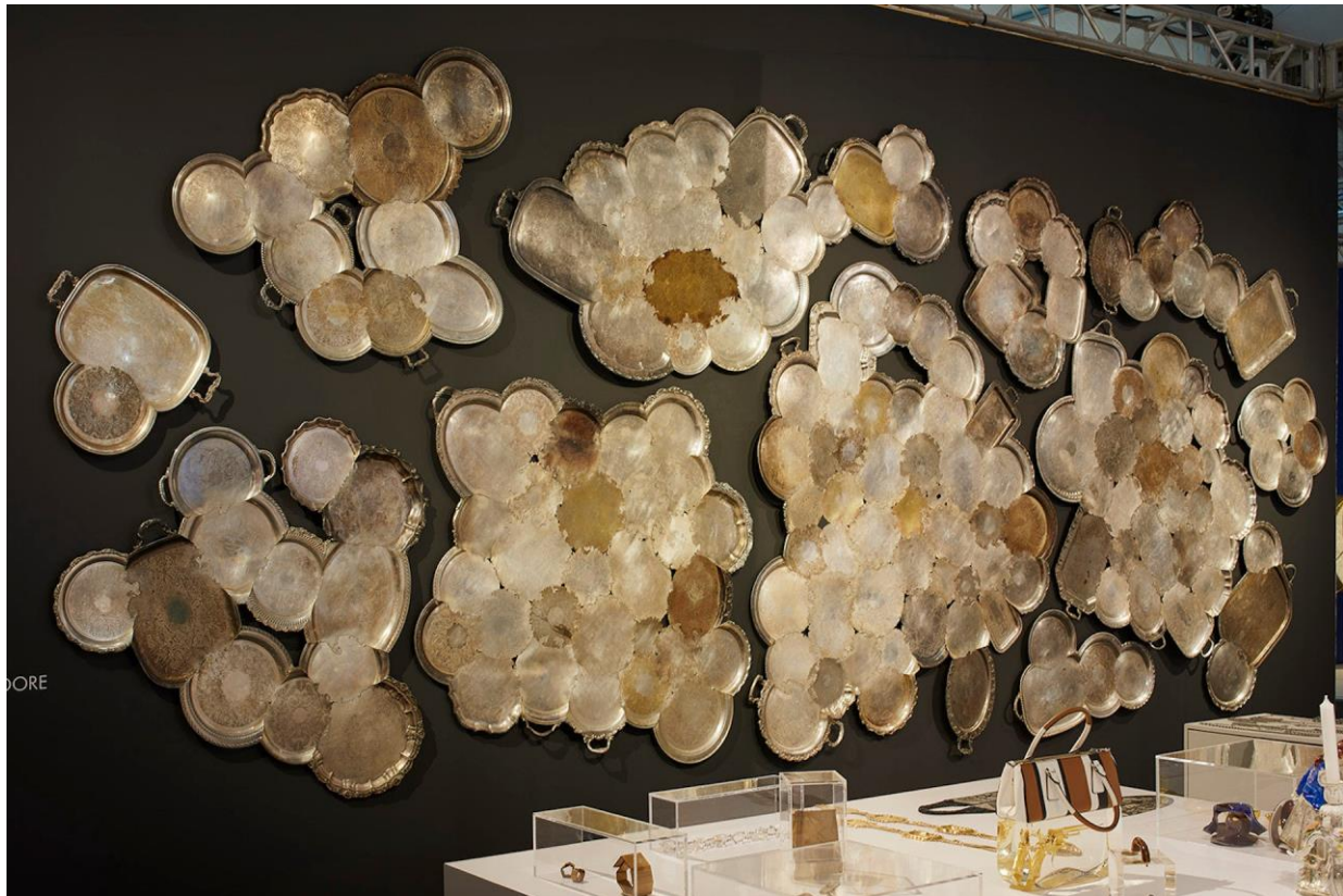
Represented by Ornamantum: Platter Scatter by Jaydan Moore, shown at Design Miami/ 2019. The National Gallery of Victoria commissioned Moore to create a 25-foot version, which will be unveiled at the museum's Triennial exhibition later this year.