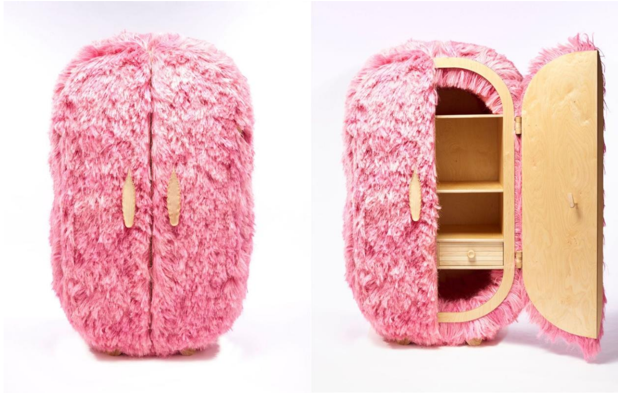
Represented by Friedman Benda: Pink Agave Cabinet by Fernando Laposse, 2021, crafted in birch plywood, agave fibers, steel mesh, kiln dried Canadian Maple, and cochineal dye. Acquired by the Dallas Museum of Art.