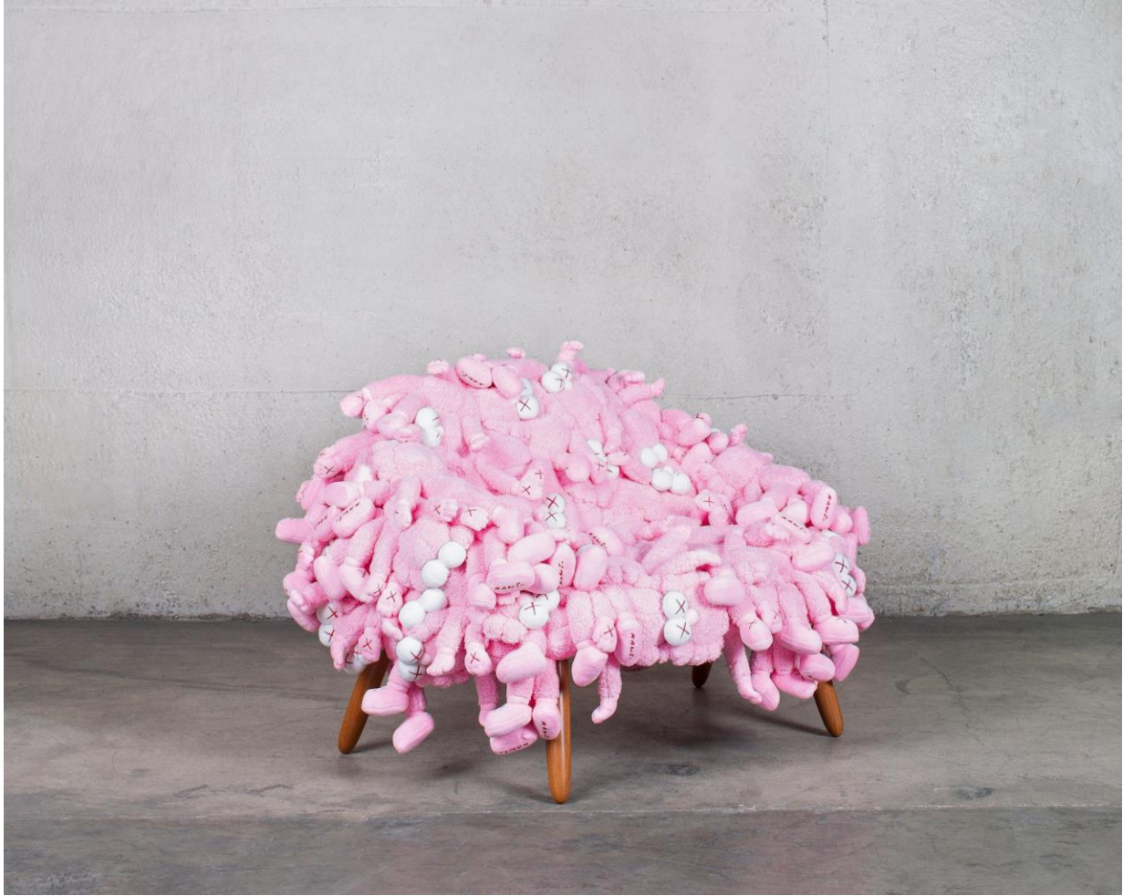
Represented by Friedman Benda: Chair Pink by KAWS x Estudio Campana, 2018, composed of plush toys, stainless steel, and cumaru wood. Acquired by the Brooklyn Museum.