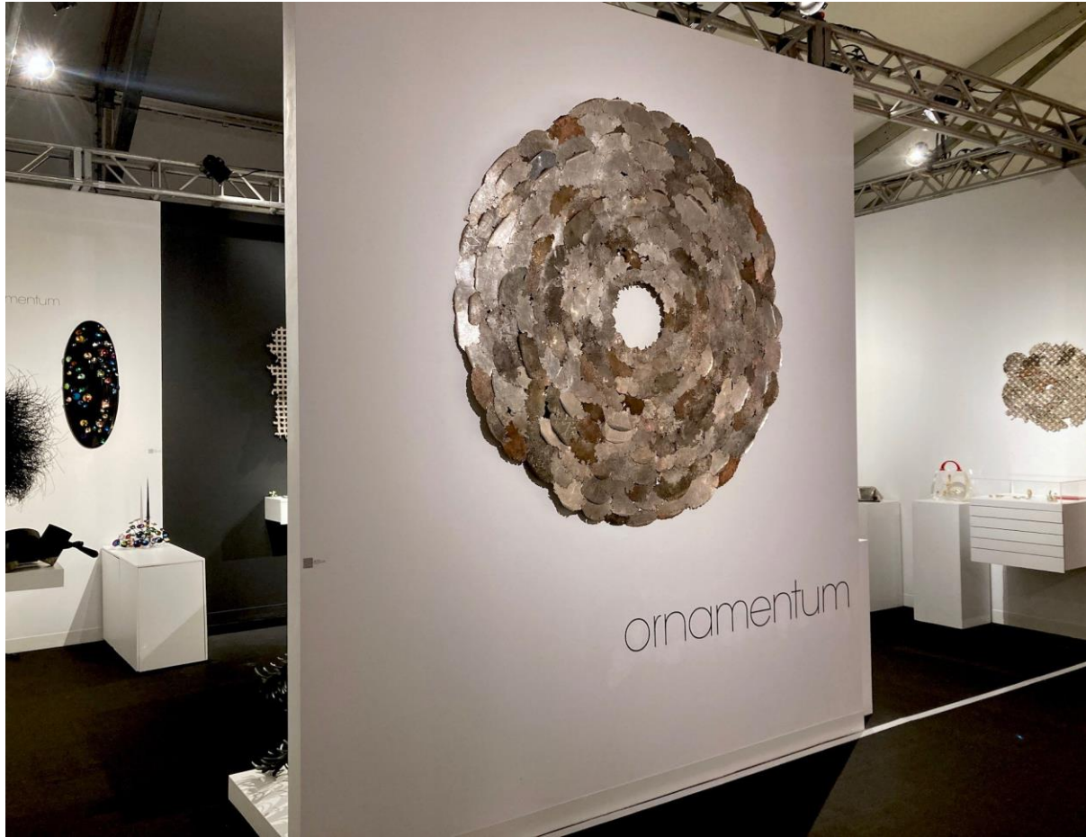
Represented by Ornamentum: Platter Shatter II by Jaydan Moore, composed of found silver-plated tableware, shown at Design Miami/ 2022. Acquired by the Dallas Museum of Art.