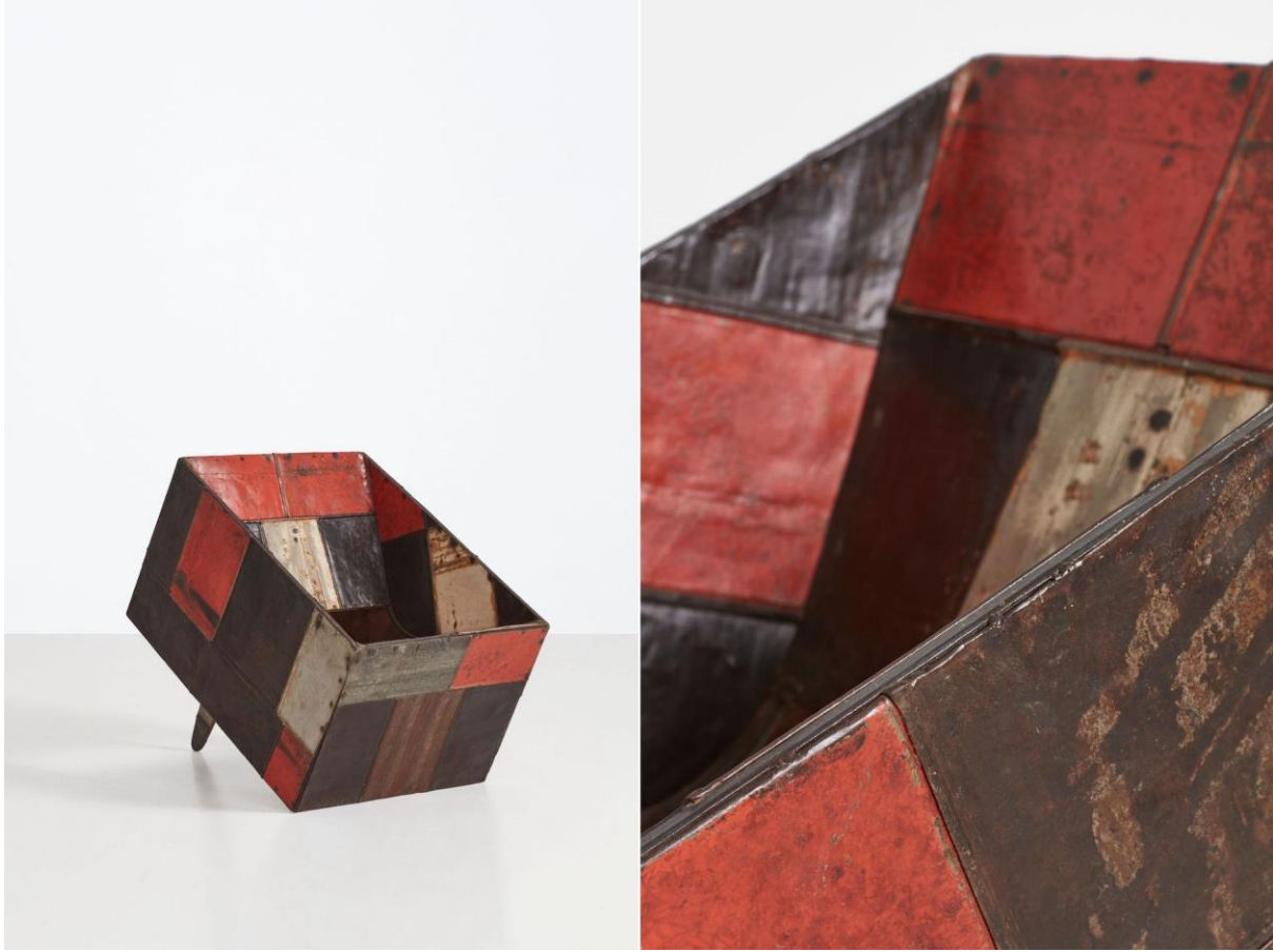
Represented by Southern Guild: M'bé-yan II (I'm Here) by Cheick Diallo, 2018, a one-of-a-kind piece made of recycled steel. Acquired by the Denver Art Museum.