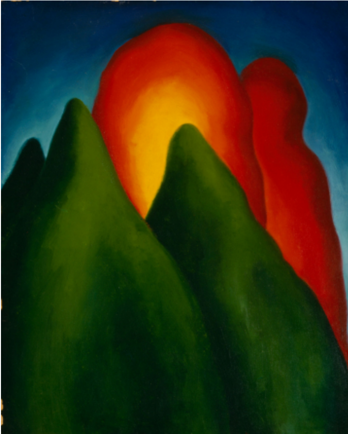
Georgia O’Keeffe, “Anything” (1916), oil on board, 20 x 15 3/4 inches October 19, 2018–January 27, 2019

Full of surprises, Unexpected O’Keeffe: The Virginia Watercolors and Later Painting more than lives up to its name. The revelatory exhibition at the University of Virginia’s Fralin Museum of Art explores little known, yet vitally important work that Georgia O’Keeffe produced during five critical summers that she spent studying and teaching at the university. When she arrived in Charlottesville, Virginia in 1912 to enroll in summer classes for female art teachers, she was troubled and unsure of her future as an artist. Her coursework, however, introduced her to the thinking of Arthur Wesley Dow, a painter, printmaker, and teacher, whose ideas about art as personal expression renewed her enthusiasm for her own work.