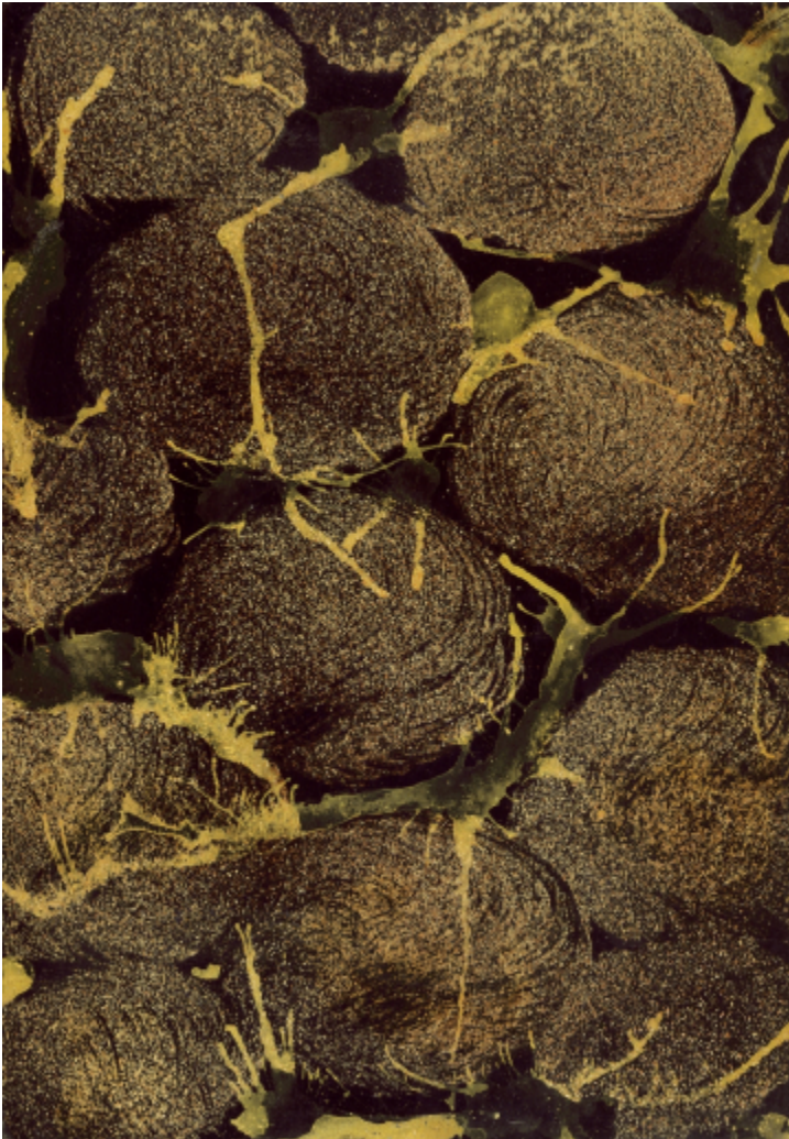
Willi Baumeister, “Untitled” (“ Ohne Titel ”) (1941), lacquer and pigment powder on wallboard, 11 1/2 × 7 7/8 inches (image courtesy Kunstmuseum Stuttgart, LG-341, © 2017 Artists Rights Society (ARS), New York/VG Bild-Kunst, Bonn, photo by Kunstmuseum Stuttgart)