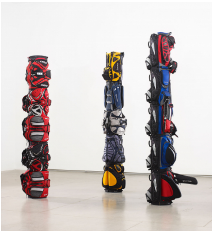
Brian Jungen, polyester, metal, painted wood on paper sonotube, 2007 (image courtesy Art Gallery of Ontario, © Brian Jungen 2017)