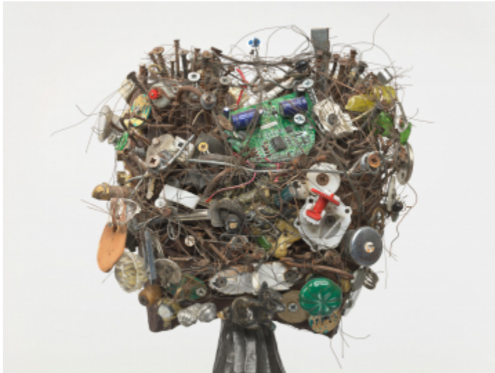
Jack Whitten, "Lucy" (2011), black mulberry, mixed media, Phaistos stone, mahogany, metal I-beam