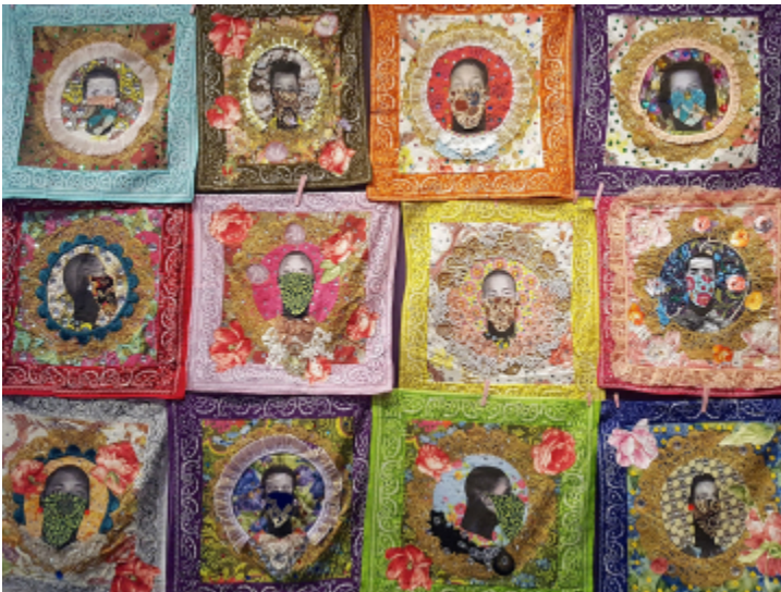
Of 72 by Ebony Patterson, detail view