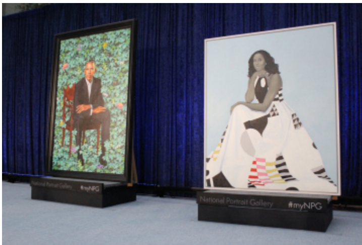
The official portraits by Kehinde Wiley (left) and Amy Sherald (right)

The unveiling and subsequent exhibition of President Barack Obama and First Lady Michelle Obama’s official portraits at the National Portrait Gallery might best be described as an ongoing cultural phenomenon, rather than an exhibition. Nine months later, there are still crowds arriving to see them, and the Portrait Gallery gift shop is so full of Obama-related merch that it’s easy to imagine, if only for a moment, that the portraits’ subjects still occupy the White House. With rare exception, outgoing presidents have selected traditional portraitists for the works that are commissioned by the National Portrait Gallery. President Obama’s selection of Kehinde Wiley was boundary-pushing, both in making Wiley the first Black artist selected for the commission and for bringing a far more contemporary sensibility to the task. Michelle Obama’s selection of Amy Sherald, a Baltimore-based painter who had, at the time, a far lower profile than Wiley’s, has brought the artist a new (and well-deserved) level of acclaim. Both selections illustrate the Obamas’ dedication to supporting Black