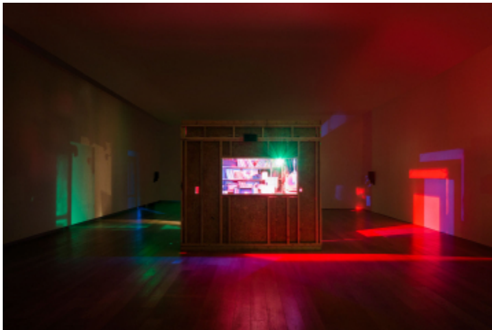
Opera for a Small Room