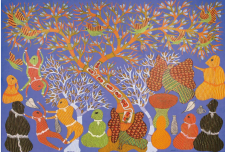
Ram Sign Urveti, "Woodpecker and the Ironsmith" (2011), acrylic on canvas