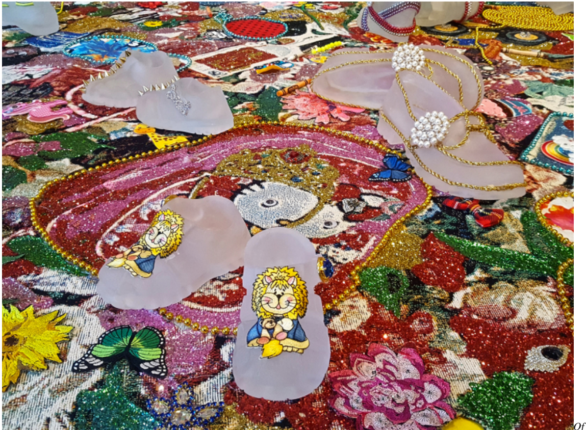
72 by Ebony Patterson (detail view)

Art visualizing identity and community took center stage in our top 20 exhibitions across the United States for 2018.