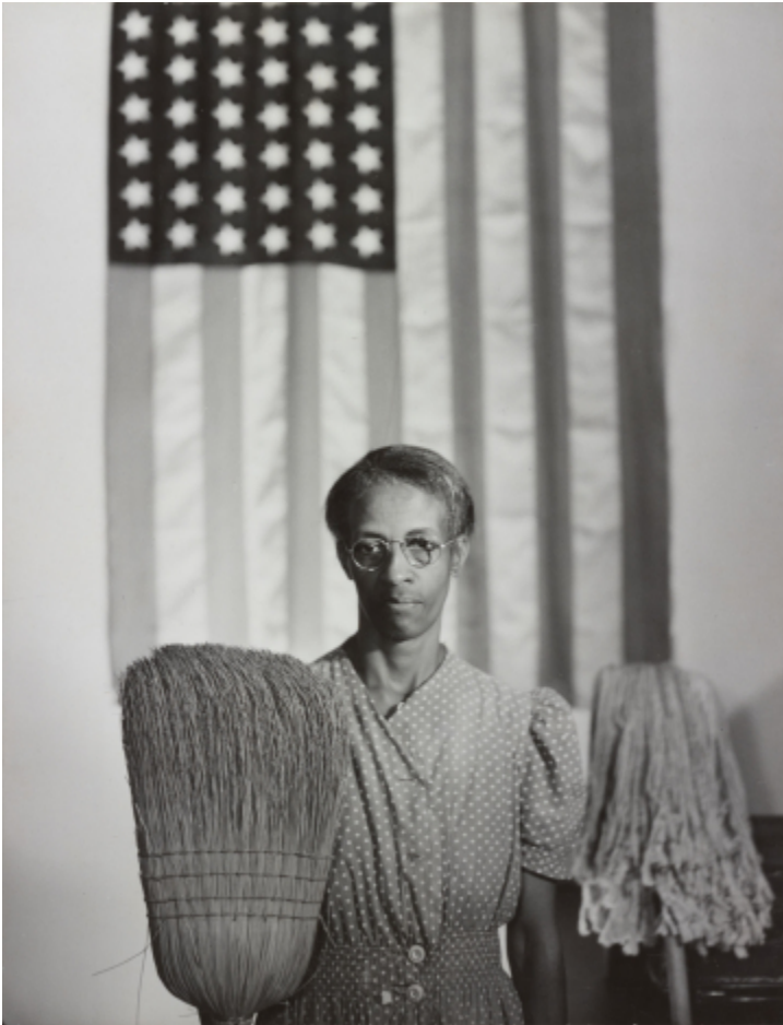
Gordon Parks, Washington, D.C. Government chairwoman, July 1942. Gelatin silver print mounted to board with typewritten caption sheet