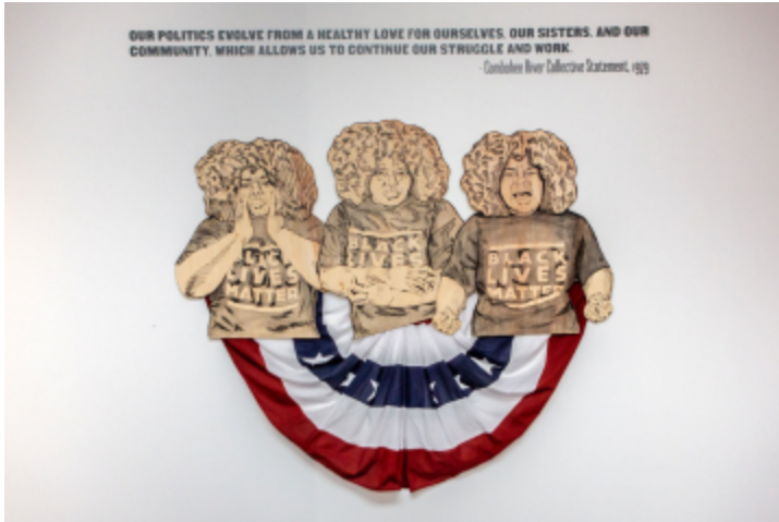
Chanel Therwil, "Pity Party: Selfies at the Start of the Trump Era," (2017), acrylic on wood with pleated flag