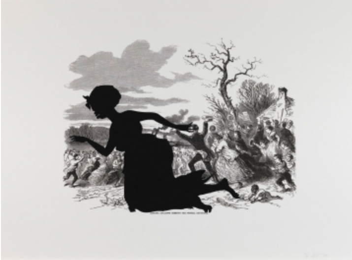
Kara Walker, "Alabama Loyalists Greeting the Federal Gun-Boats," (2005) from the portfolio Harper's Pictorial History of the Civil War (Annotated), offset lithograph and screenprint on paper, 39 x 53 inches