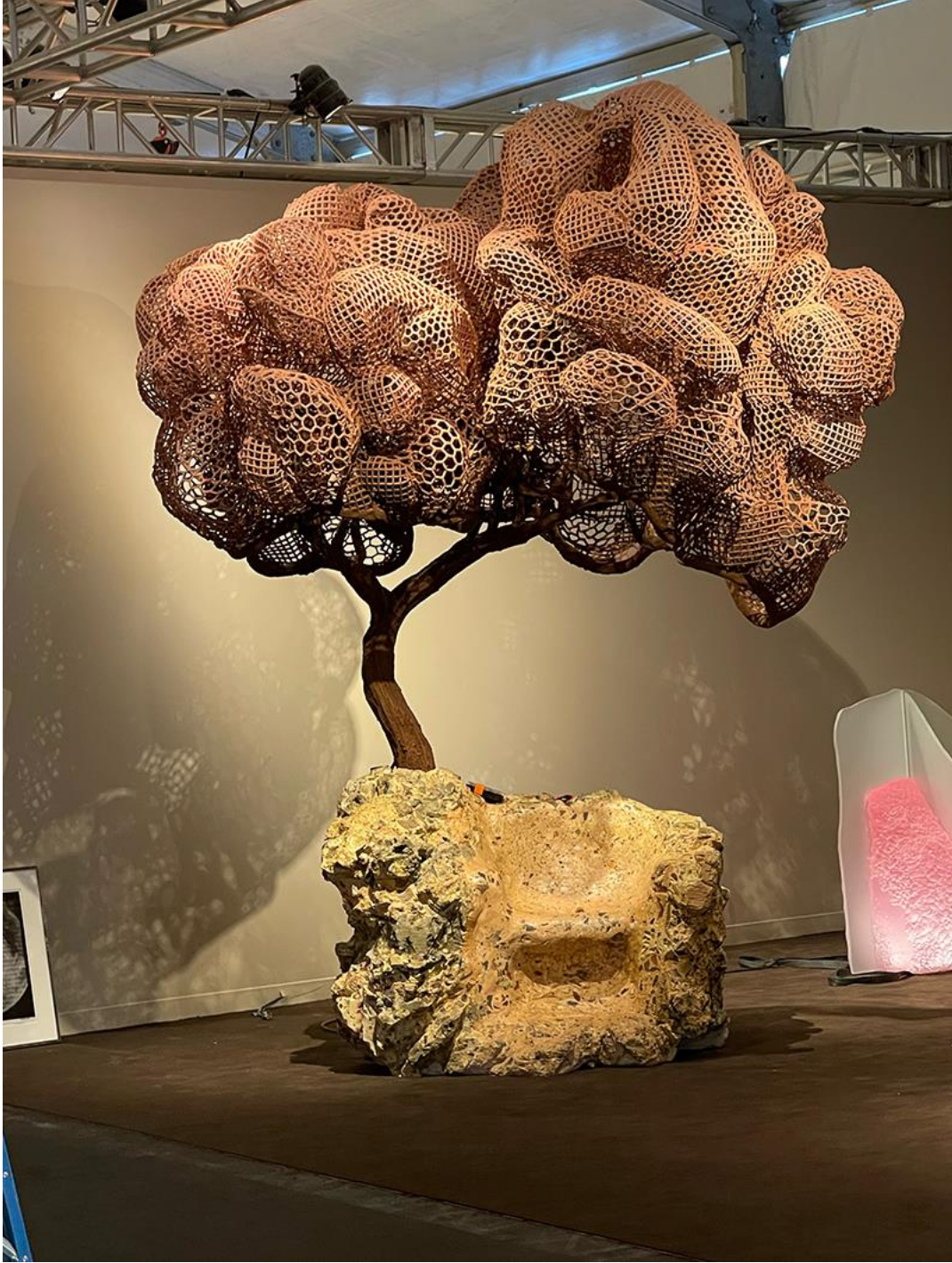
Nacho Carbonell. Country of Origin: Spain. Shown by Carpenters Workshop Gallery. Tree proving both light and shade in copper and concrete and stone.