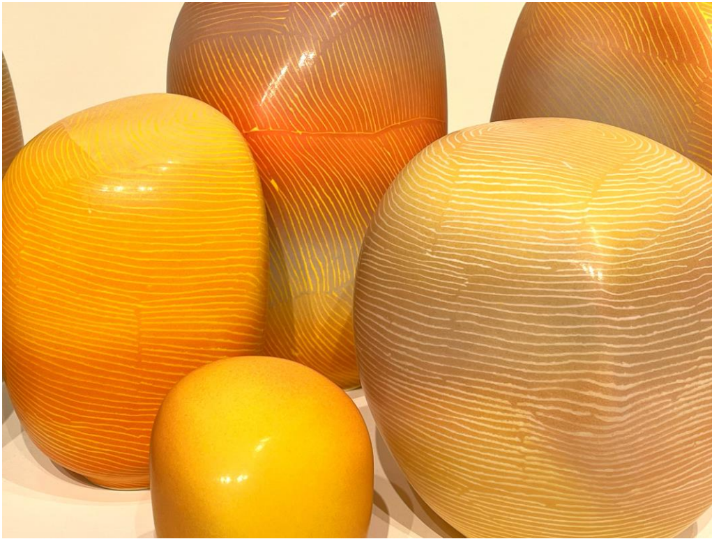
Shown at Adrain Sassoon Gallery. Pippin Drysdale In her 80s continues to create elegant ceramics. Country of Origin: Western Australia.