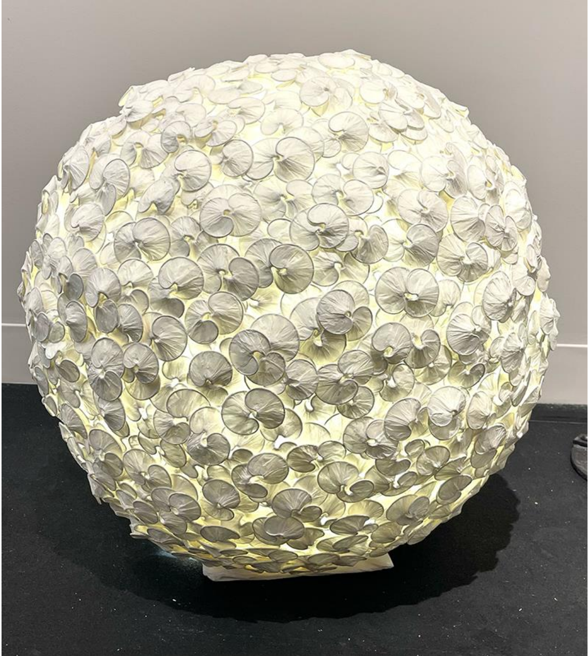
KAKU at Ippodo Gallery. Country of Origin: Japan. Made out of recycled mulberry paper the paper and used Noguchi lighting. PHOTO: