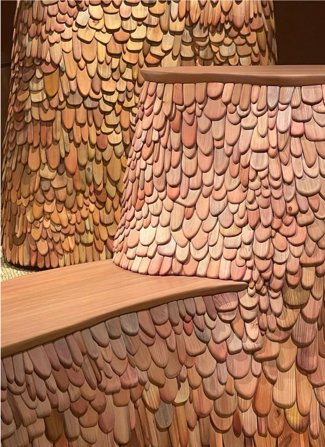
Country of Origin: Great Britain. Lukas Wegwerth at Fumi Gallery. A new shingle style armadillo series.