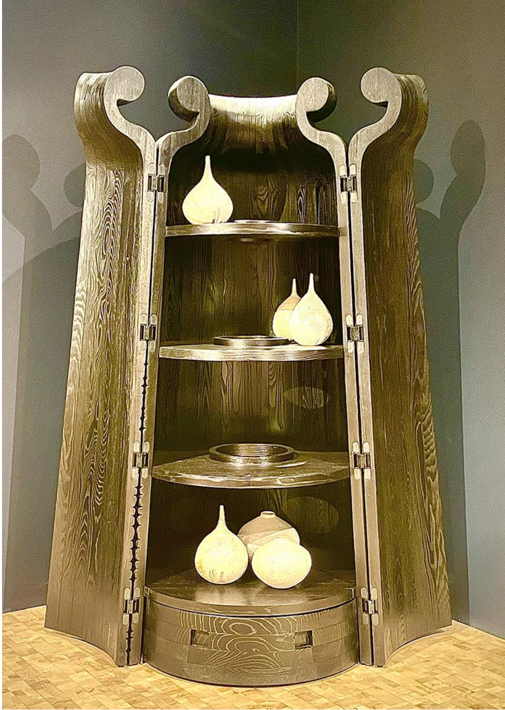
Hamza Kadiri, The Balthazar Armoire shown at Atelier Courbet. Country of Origin: Morocco.