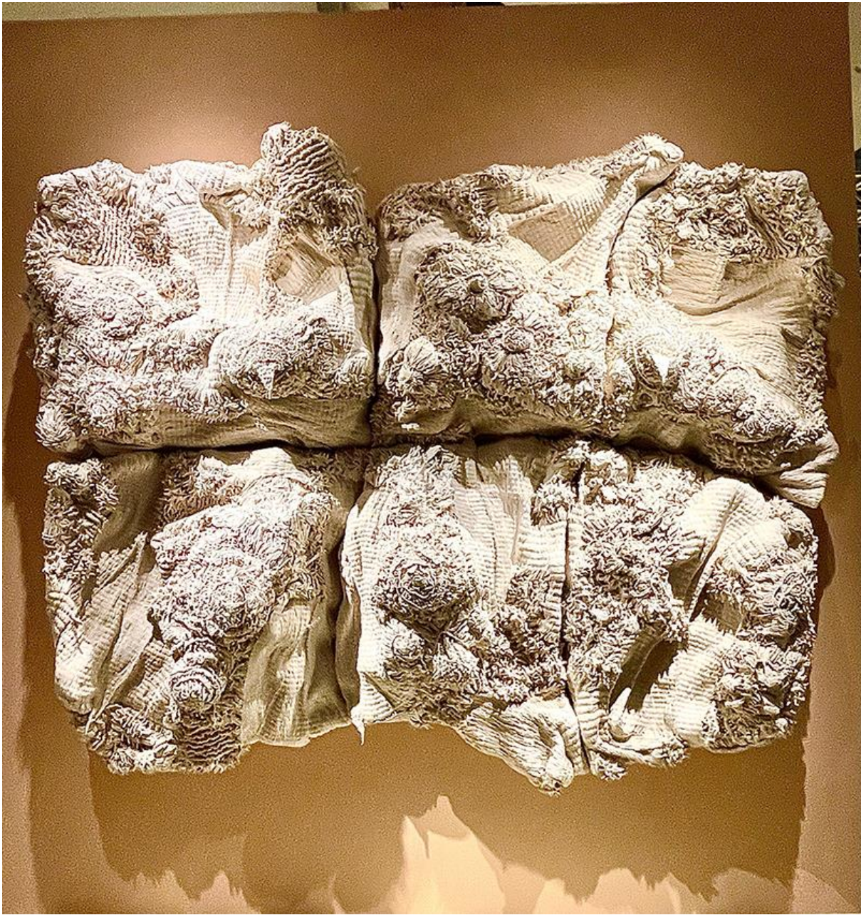
Lin Fanglu, She's Landscape , (2023). Country of Origin: China. Shown by Sarah Myerscough Gallery.