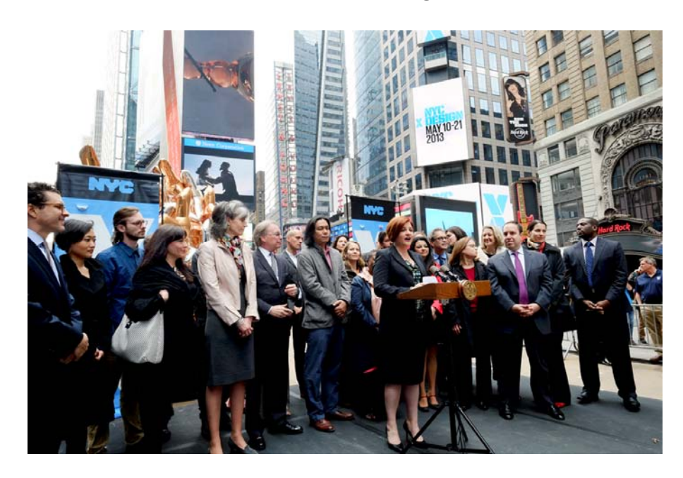
Kick off of the inaugural NYCxDESIGN week, May 2013

Design of all disciplines will take New York City by storm later this week with the start of the second annual NYCxDESIGN festival (May 9-20), which includes more than 300 events at venues throughout the city. Whether at home, at work, or somewhere in between, you're likely to be within a stone's throw from a New York Design Week event or exhibition.