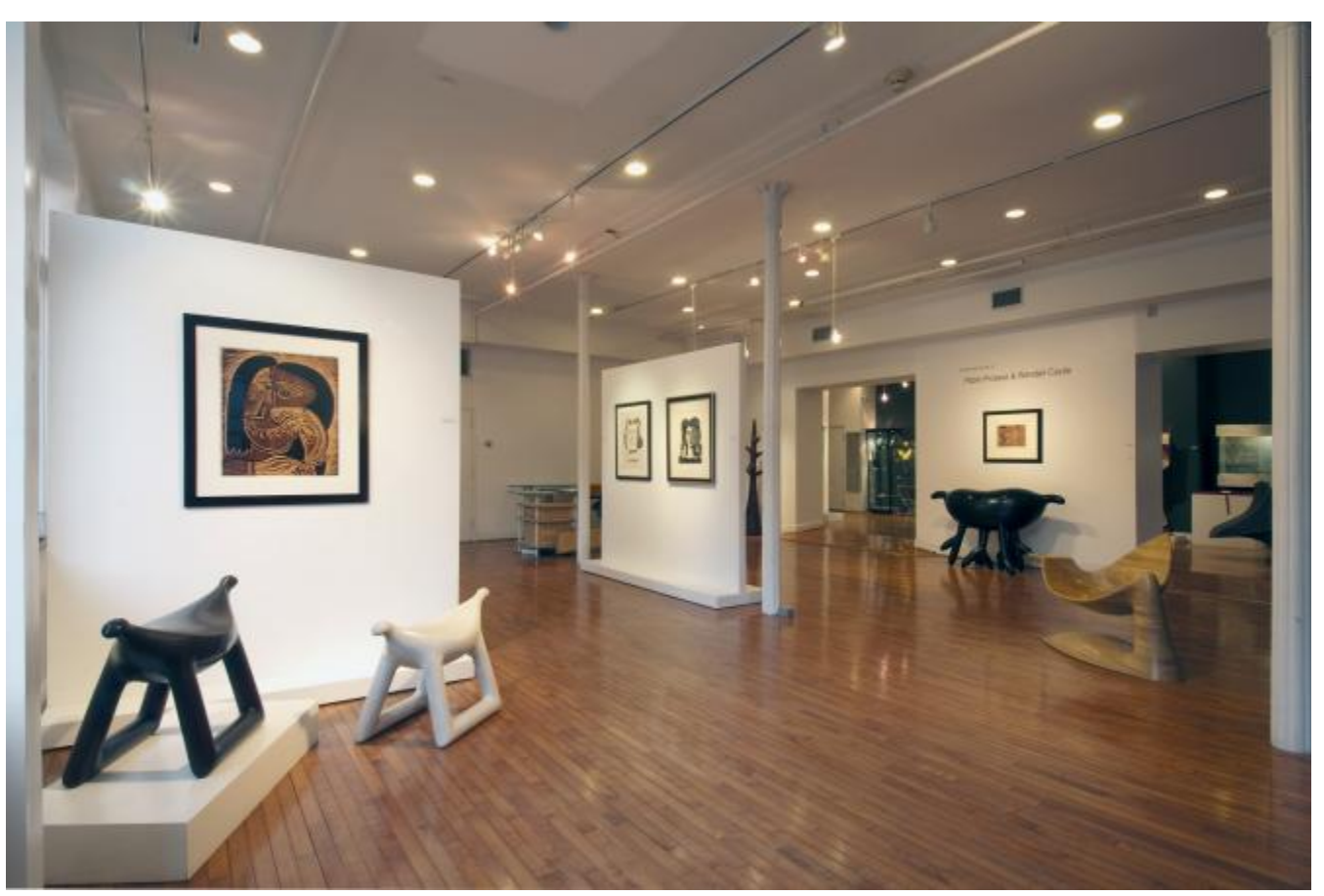
Picasso, Castle, Gallery View | Image courtesy of Wexler Gallery

Wexler Gallery, 201 N 3rd St, Philadelphia, PA, USA, +1 215 923 7030