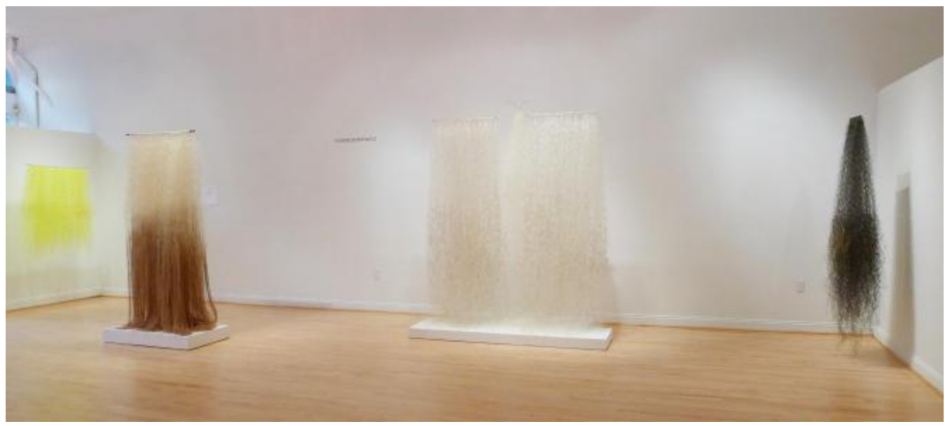
"Concept+Materials: Philadelphia Textile Masters" by Yvonne Bobrowicz / Courtesy of Snyderman Works Gallery