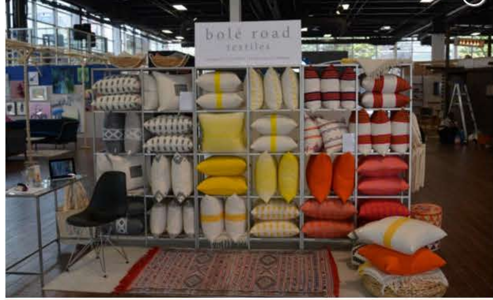
Cushions from Bole Road will be sold at BD.

For chic hipsters: Interactive fair Bklyn Designs promotes the best of the borough's furniture, lighting, textiles and accessories designers, with workshops, installations, a temporary tattoo parlor and a David Rockwell-designed playground. Bklyn Buys, the show's marketplace, has budget-friendly design options like LED Edison bulbs ($20) from Urban Chandy, planters from Come Out to the Coast (starting at $25), and totes and tea towels from CaribBEING, which is also staging a Caribbean art show in a pop-up shipping container.