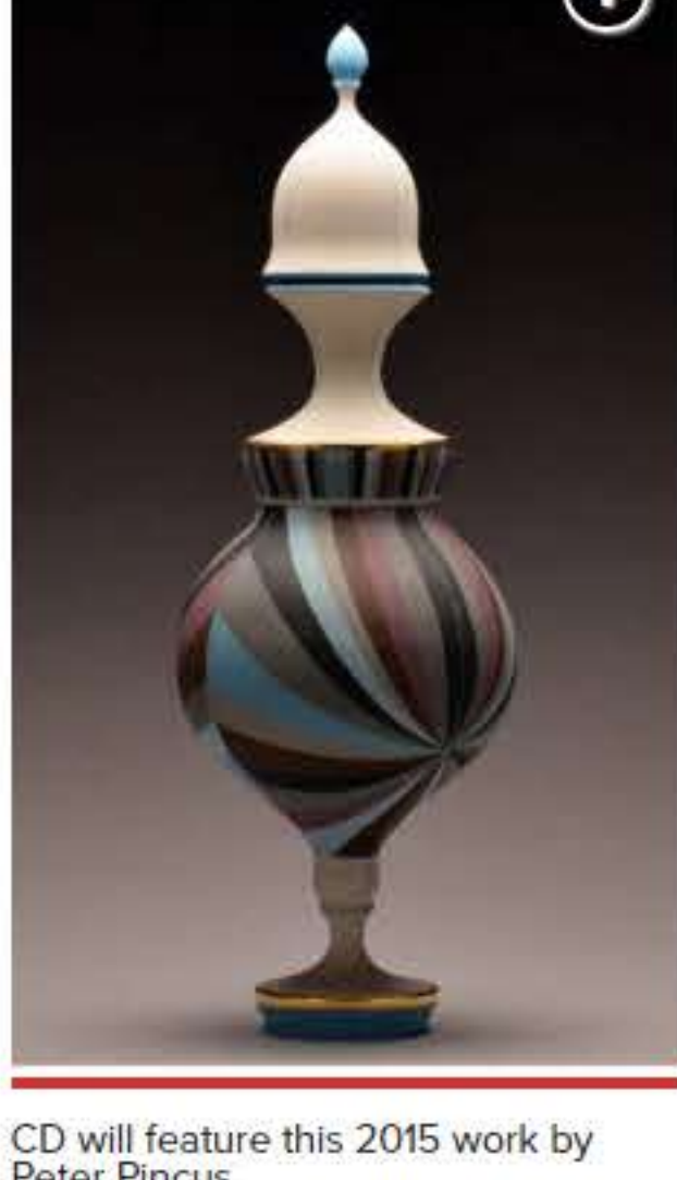
CD will feature this 2015 work by Peter Pincus.

Besides browsing through well-selected furniture, jewelry and decorative objects, visitors should check out Collective Concept, a special exhibit in which industry stars like "it" lighting designers Lindsey Adelman and Apparatus Studio, Calico Wallpaper and the ceramics firm Cocobolo Design provide glimpses into their creative processes.