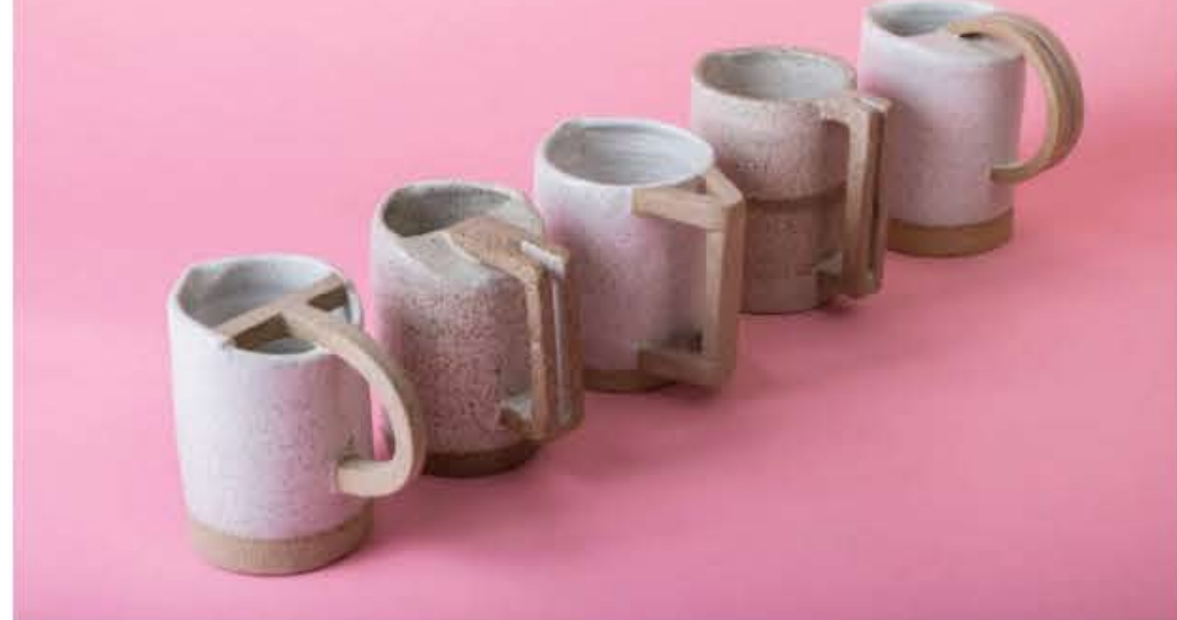
Mugs by Saint Karen.