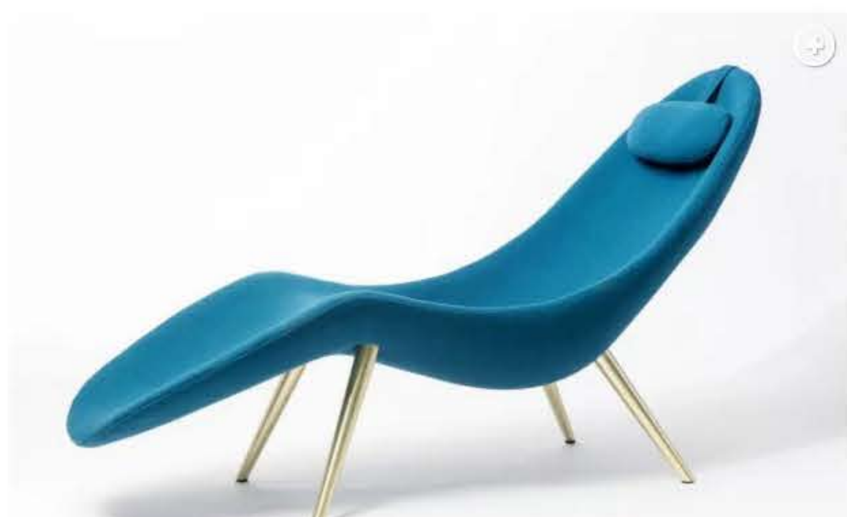
A chaise lounge by Konekt.

For global design buffs: A standard-bearer for NYCxDESIGN week, ICFF is the place to spot international trends in fabric, color, style and design. The large fair fills the Javits Center, and while it's geared largely to professionals, this year's new Design Milk pop-up shop is a great place for souvenirs, featuring 13 up-and-coming US designers selling textiles, wallets and jewelry. Among emerging designers, check out Brooklyn-based Noble Goods, who create modern home furnishings in wood and resin, and San Francisco-based Wildebeest, which makes extremely elegant leashes, food mats and jackets for lucky cats and dogs.