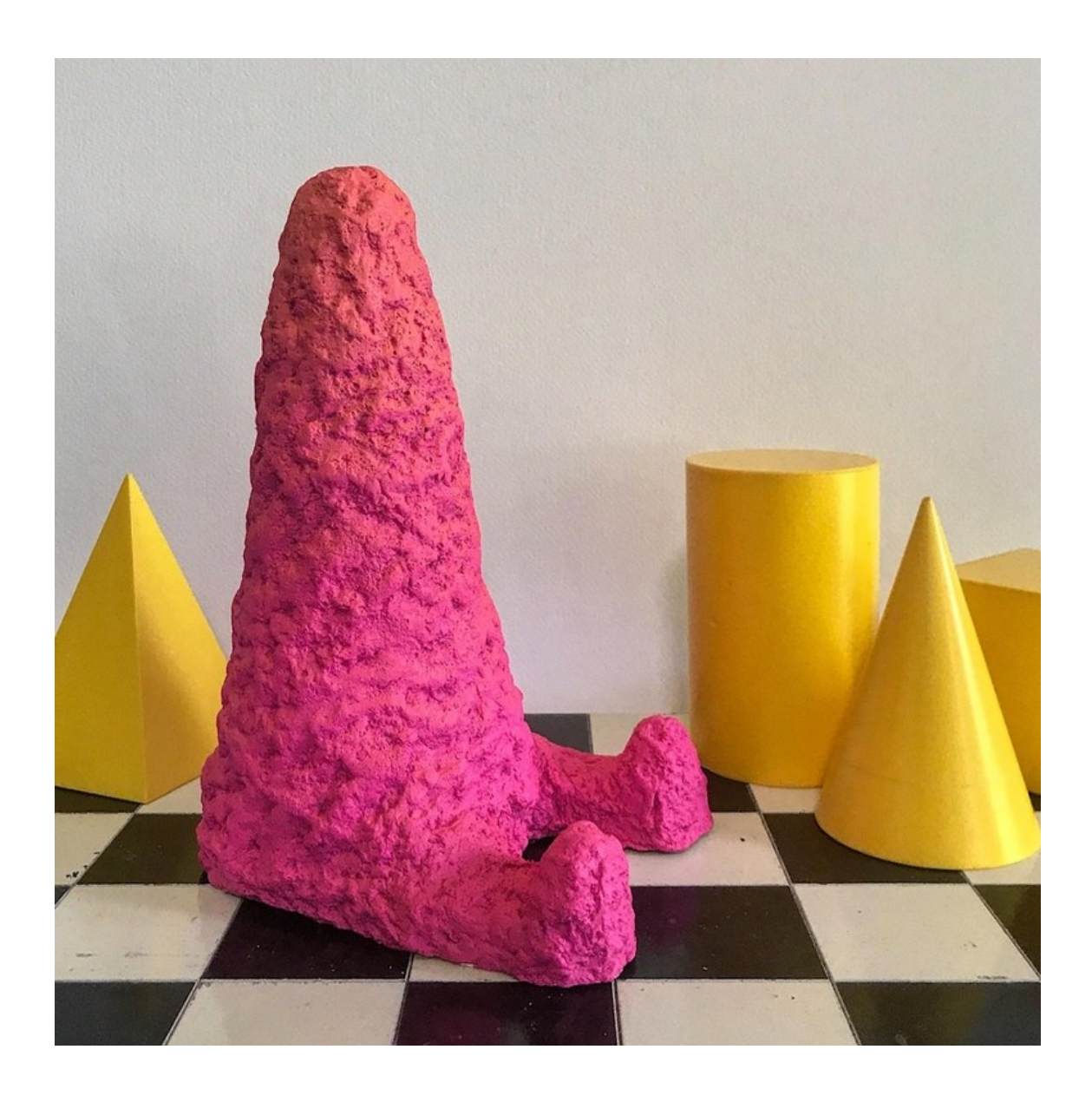
Vintage finds from Marquis De Mod.