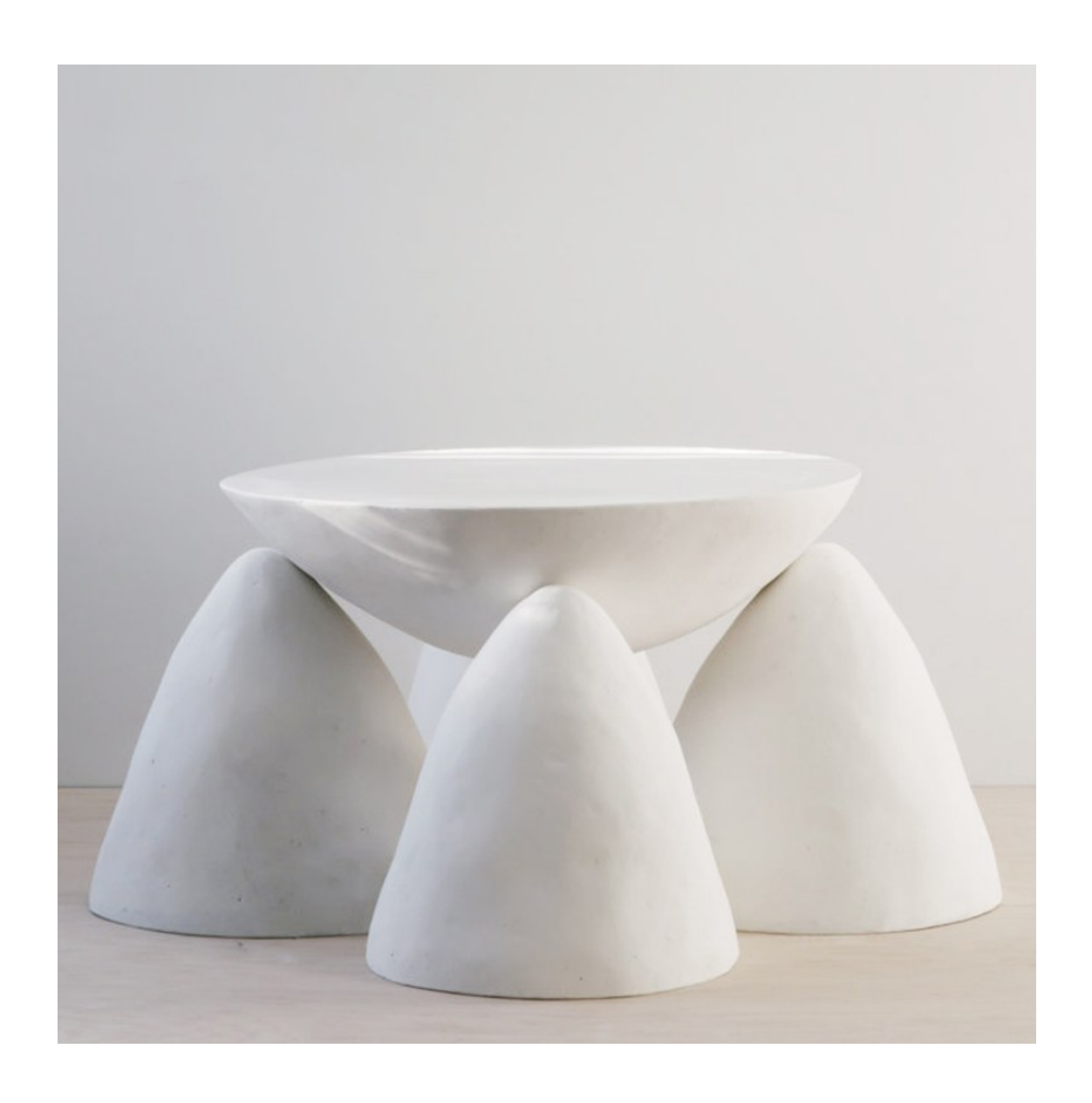
Plaster and gypsum tables and light by <u>Blanche Jelly</u>.